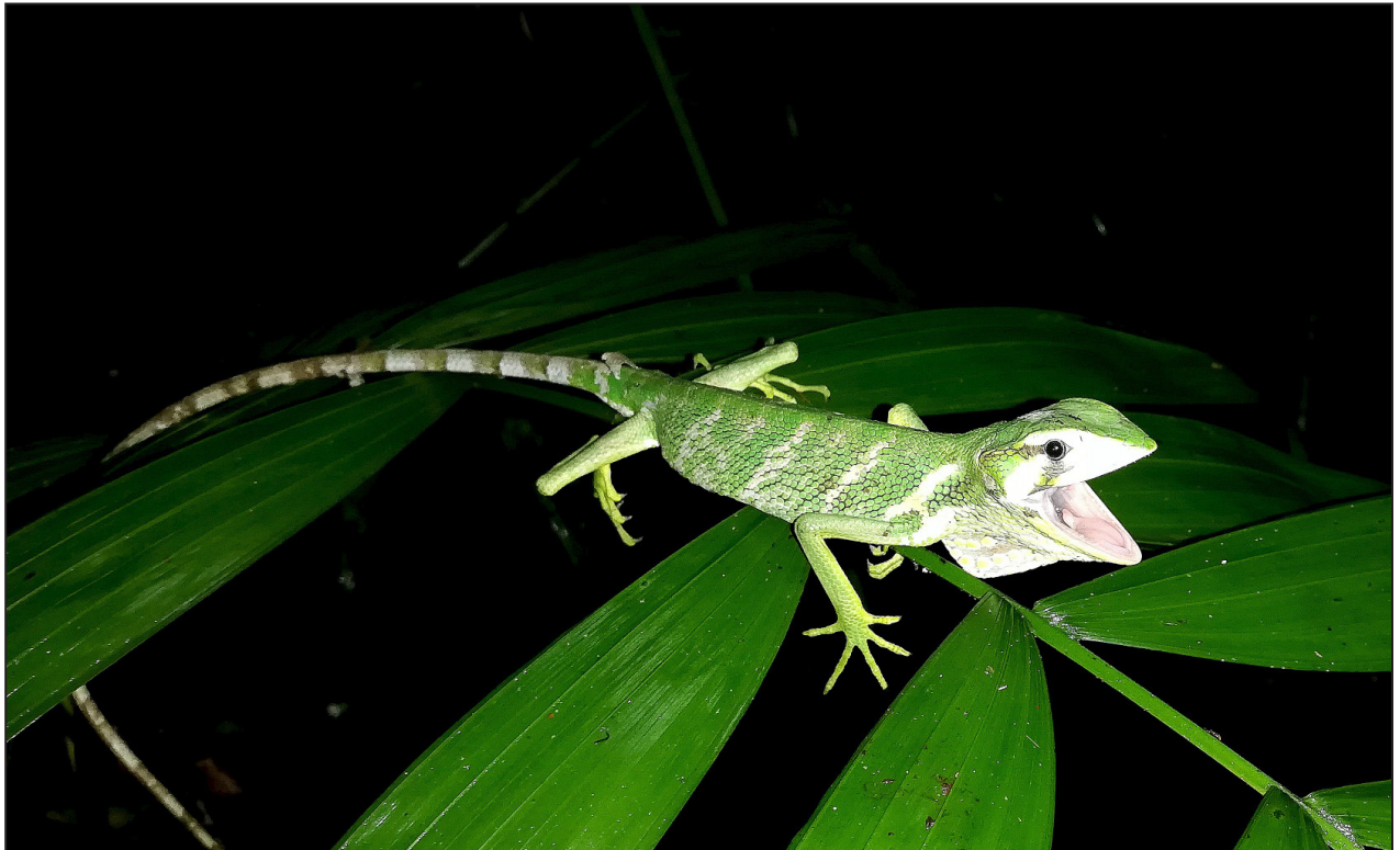
Figure 2. Adult male of Polychrus gutturosus (UTADC 9887), buffer zone of Reserva del Hombre y Biosfera del Río Plátano, Olancha Department, Honduras.

and therefore fill other information gaps as is the case of the center and west of the Colón Department and the west of the Atlántida Department, where there are no records.